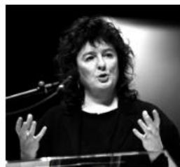
Carol Ann Duffy